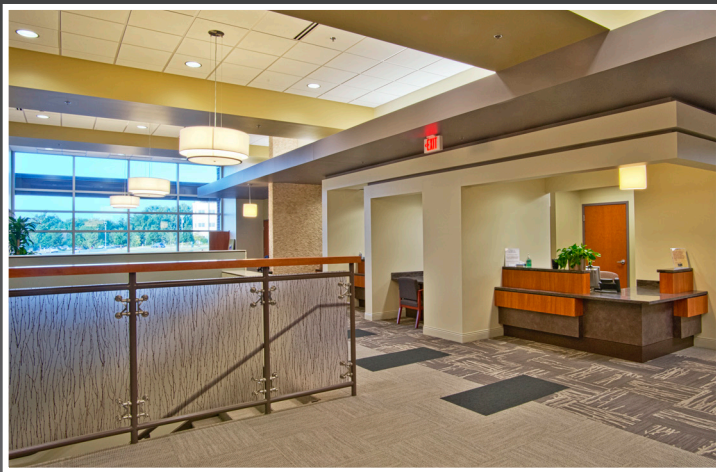
Women's Health Advantage - Dupont